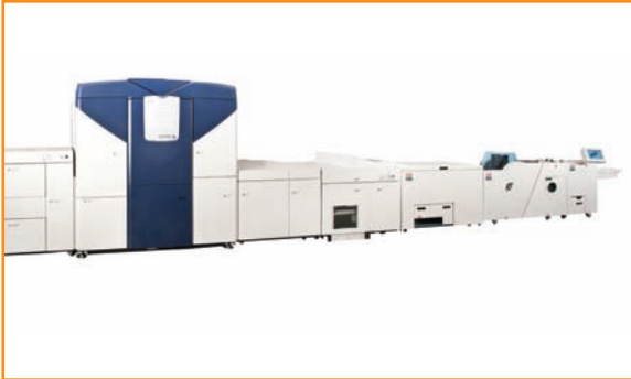
Printer + BCME-x + BME-x