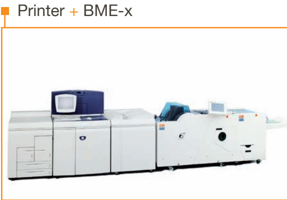
Printer + BME-x