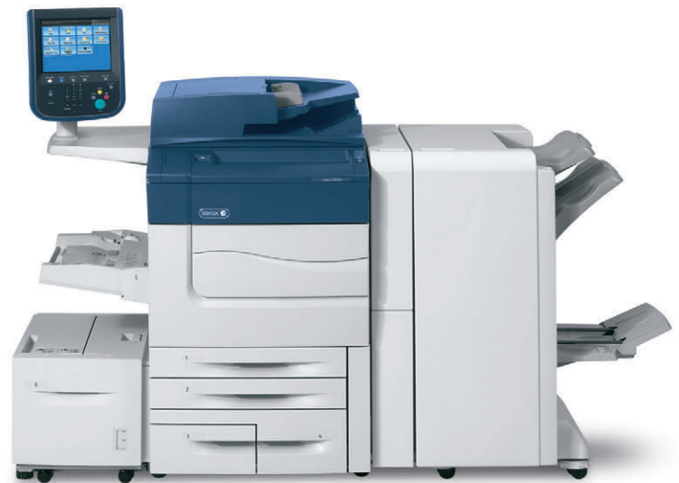
Xerox® Colour C60/C70 Pro Printer shown with High Capacity Feeder and BR Booklet Maker Finisher

Xerox® Colour C60/C70 Pro Printer with the Xerox® Colour C60/C70 EX-i Print Server plus Impose, Hot Folders and Virtual Printers.