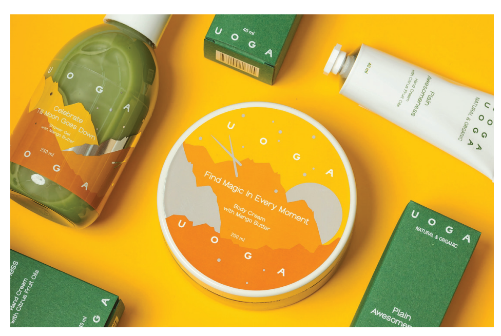
With enhanced media versatility and the ability to print on-demand embellishments such as White, Zuzu Print is perfectly positioned to take on more high-value applications such as packaging.